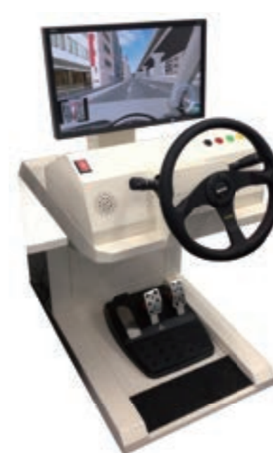
UC-win/Road Simple Driving Simulator for seniors