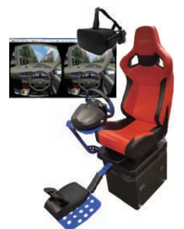
VR Motion Seat