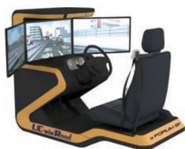
Compact Drive Simulator