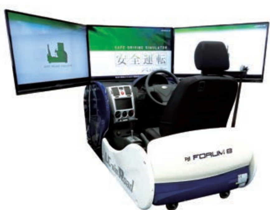
Certified Safe Driving Simulator